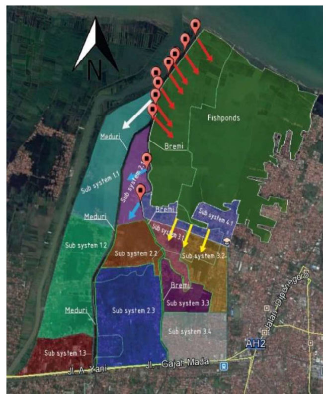
Figure 4 Locations indicated with red dots as found during field research where water can intrude.

By doing more than 92 measurements on waterways and water infrastructures, it became clear that there are several fatal locations. At these locations water from the Meduri and Bremi intrude into the rural and urban area, figure 4 shows these locations with red dots. The connections are mostly culverts but also several bridges which allowed water to intrude into the rural or urban area causing diurnal inundation, examples of these connections are shown in figure 5 and 6.