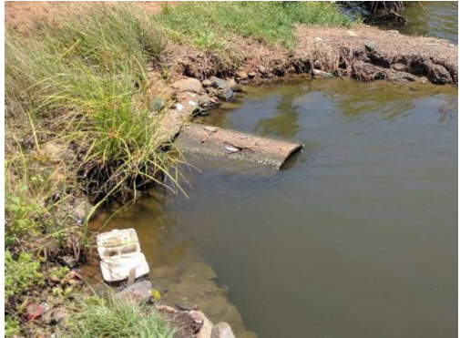
Figure 5 One of many culverts which allow water to flow in to the rural or urban area.