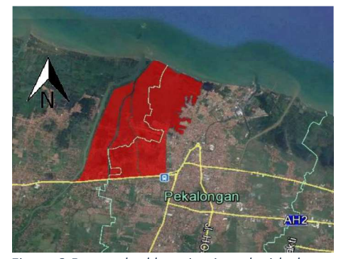
Figure 1 Location Pekalongan on Java, Indonesia.