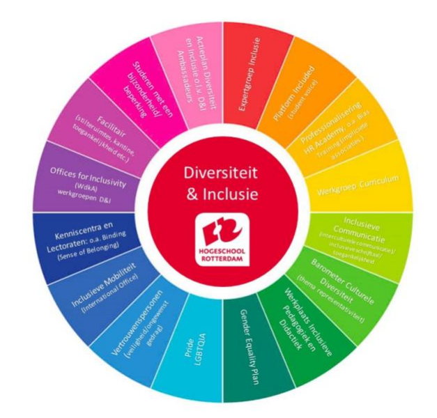
Figure 1. The Inclusion pie D&I at RUAS

II. Secondly, you can analyse the activities in the inclusion map, either for a specific situation or cohesively. And if there is no activity yet at a research centre, institute, or service department, you can quickly find out about existing or desired Diversity & Inclusion activities with three question categories. (See below) The descriptive analysis model places Diversity & Inclusion activities in a certain theme, clarifies at which intervention level in the organisation the activity is carried out and which target groups are central to the activity.